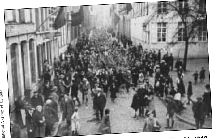
Canadian troops reaching Mons, Belgium, on November 11, 1918