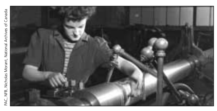
Woman lathe-tender working on a gun barrel in Hamilton, Ontario during WWII

1944 The Department of Veterans Affairs is created to help veterans return to private life.