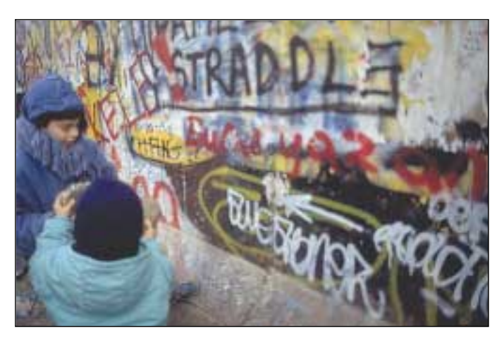
Children taking pieces of the Berlin Wall for souvenirs