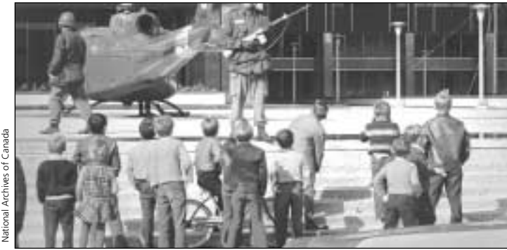
Canadian troops enforcing the War Measures Act