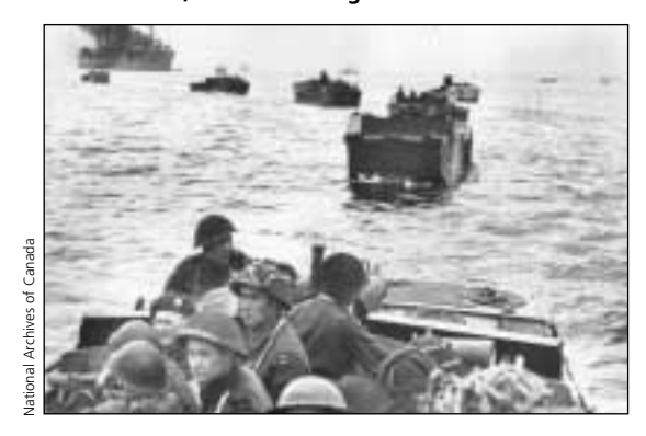
Canadian Troops landing on Normandy beaches, D-Day

target, followed all the way by the search light. We expected a German night fighter to hit us at any moment and we were not disappointed."