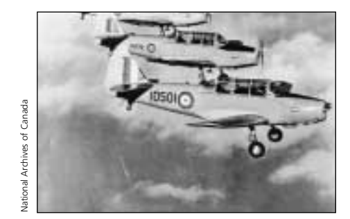
Cornell light training aircraft