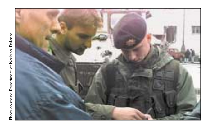
Canadian troops in Bosnia