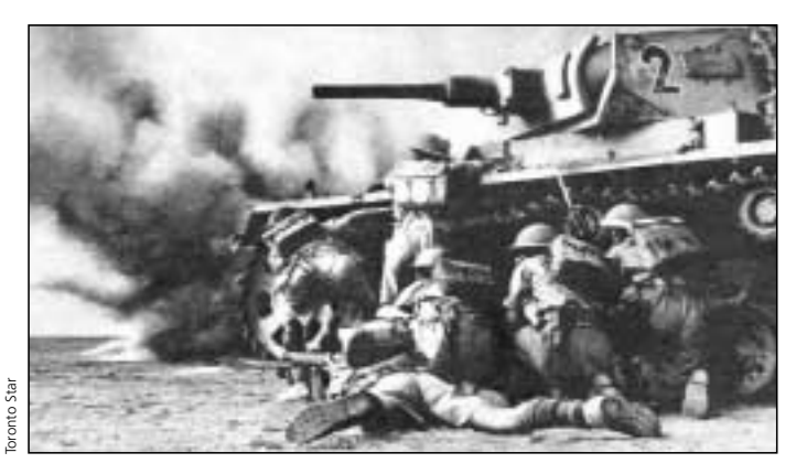
Troops under fire in Tunisia