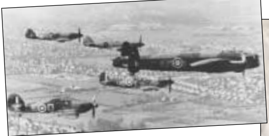
Lancaster bomber under escort