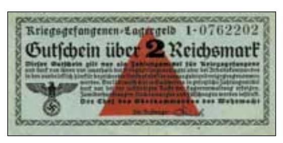
Escape Money Kit