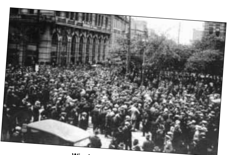
Winnipeg General Strike