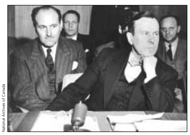
Pearson at United Nations