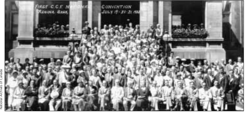
The first C.C.F. (Co-operative Commonwealth Federation) Convention, at Regina in July 1933