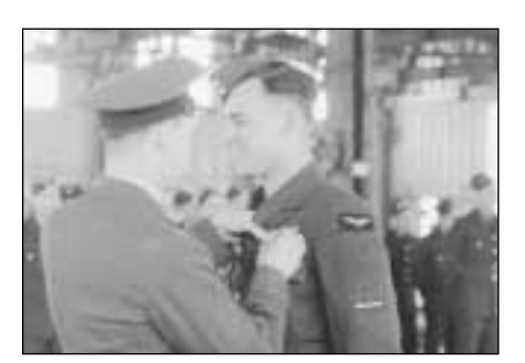
Grant receiving wings