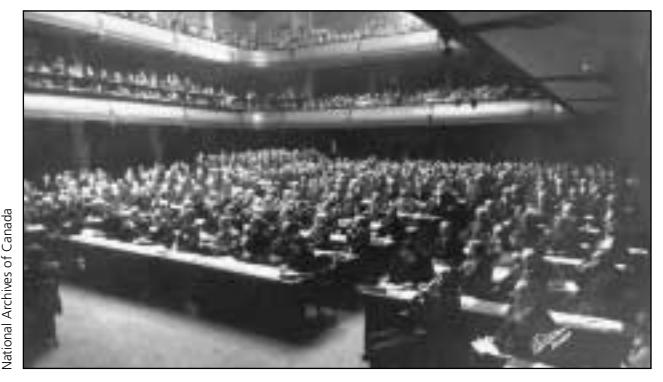
League of Nations meet in the Main Chamber