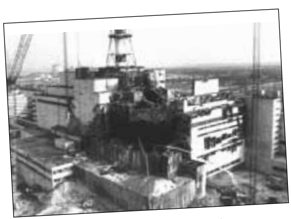
The explosion at Chernobyl