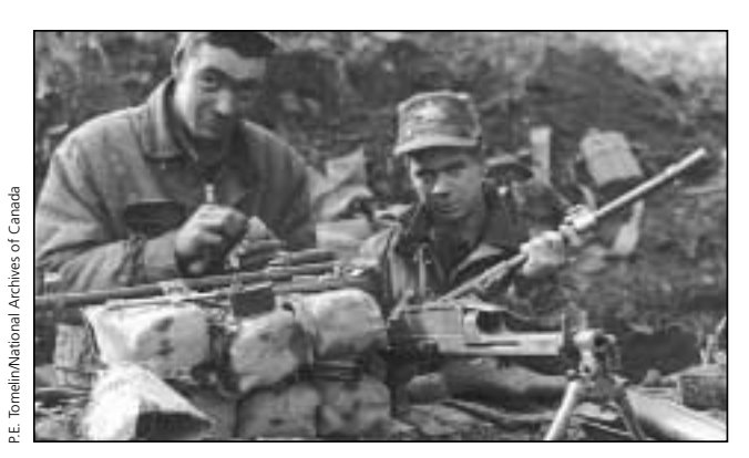
Canadian troops in Korea