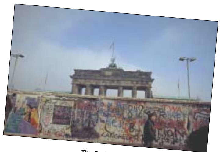
The Berlin Wall