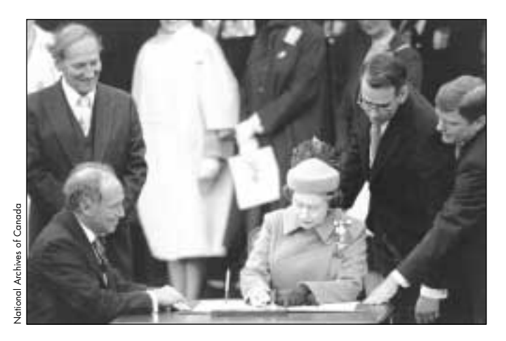
Queen Elizabeth II signing the Constitution Act