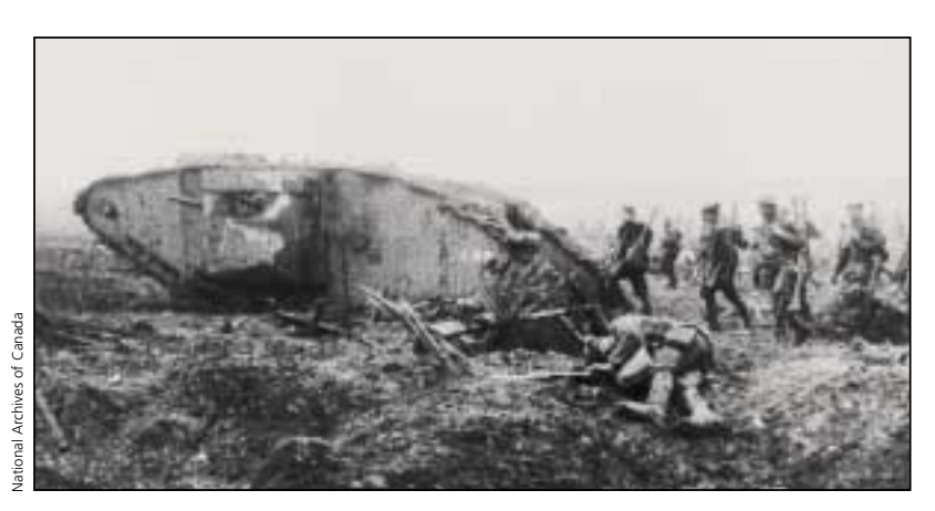
Canadian troops in World War I