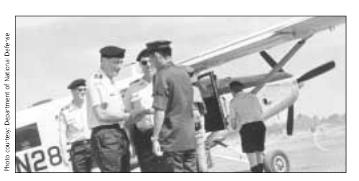
Canadian Troops in Vietnam